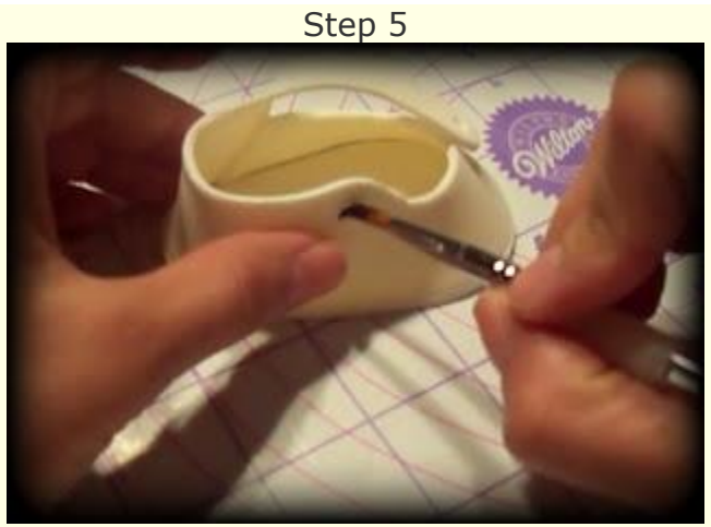
Apply a little bit of water or edible glue.